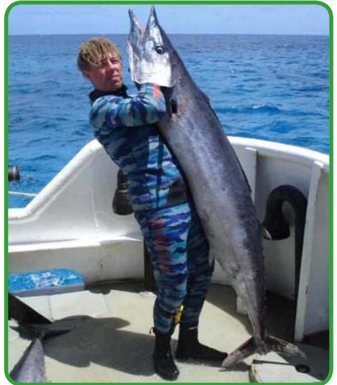
▲ This is a 50 kg wahoo speared in the Coral Sea.... Nothing to do with our club but pretty impressive eh!?

If anyone would like to contribute to our newsletter with stories, pictures, recipes, gear for sale, information, advertising (diving and non-diving products/services), opinions, facts or anything else I haven't thought of, please do so by contacting the editor. THIS NEWSLETTER NEEDS THE CONTRIBUTIONS OF CLUB MEMBERS TO EXIST.